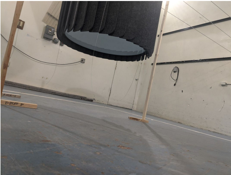
Figure 2 – Specimen mounted in test chamber