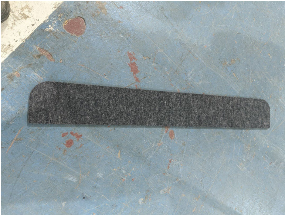
Figure 4 – Individual specimen fin prior to installation to hub