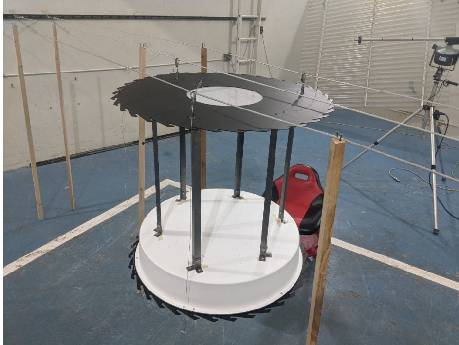
Figure 3 – Specimen top and bottom hubs connected by “V” columns