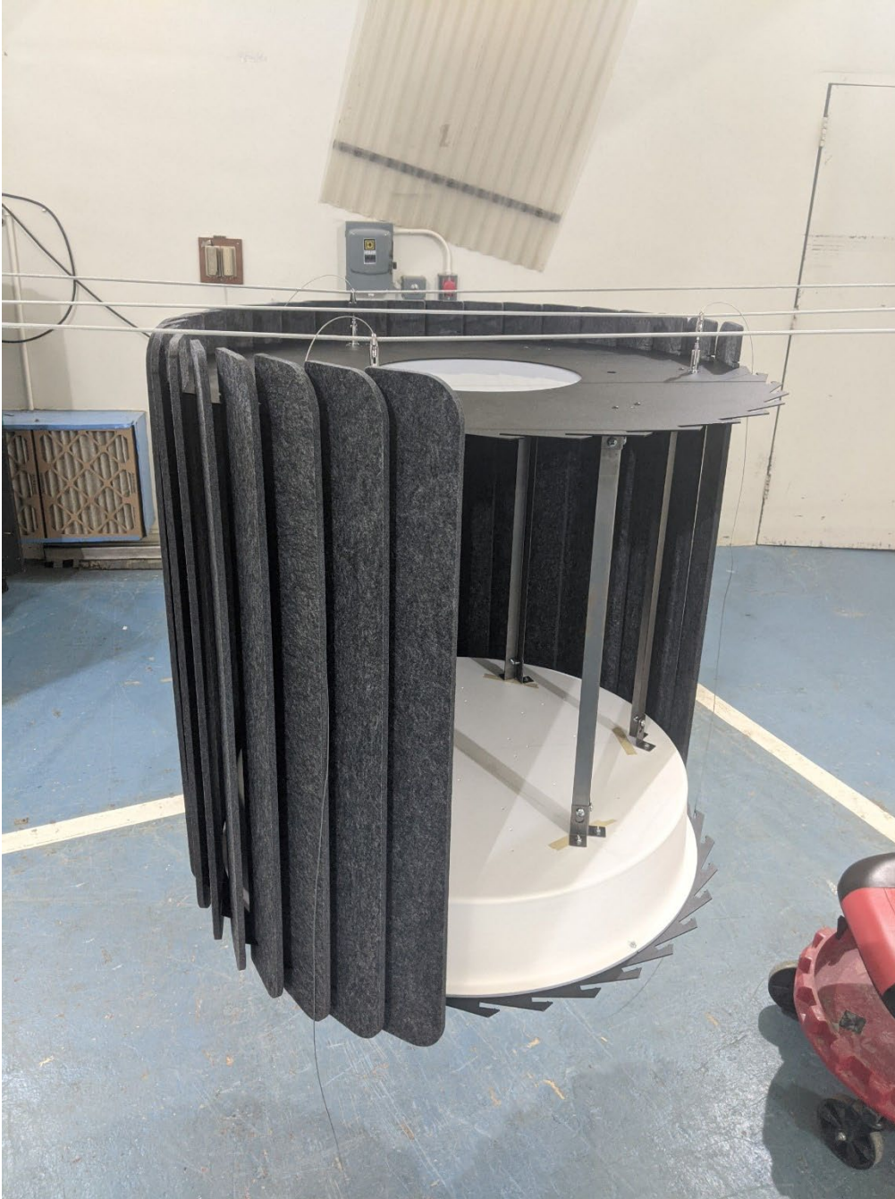
Figure 5 – Specimen fins partially installed to hubs