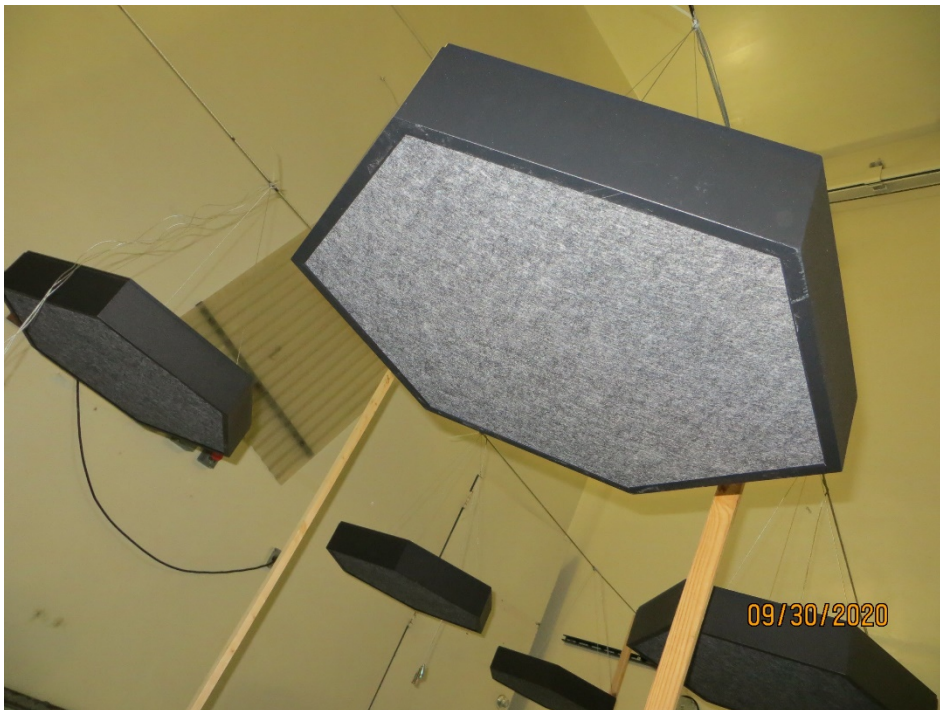
Figure 2 – Underside of individual fixture, semirigid felt panel